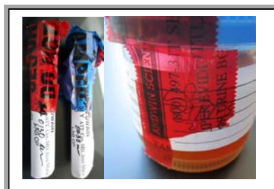
Figure 3: Label information obscured by tape.