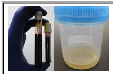
Figure 1: Shown at left, adequate blood volumes for analysis. Gray-stoppered 7mL vacutainer® tubes are best for collection. At right, this urine sample is inadequate for full toxicological analysis. Submit at least 25-30mL (1 fluid ounce).

What about the request form? The Form 49 is the analytical request form required for submission of evidence to the laboratory. It should list the name of the investigating agency as well as the case number, especially if it is different from the DRE agency's case number. For urine toxicology, including the suspected drug categories or illicit drugs/prescriptions mentioned by the suspect allows the laboratory to ensure that the sample is tested for any drugs require specialized procedures for confirmation. The request form should also clearly describe the sample and identify the analysis needed. If the information is too vague, or if important information is absent from the Form 49, the evidence may be rejected. At this time, OSP Forensic Toxicology can analyze urine samples for drugs and blood samples for ethanol. If a toxicological drug screen is required on a blood sample, it must be submitted to an external laboratory for analysis.