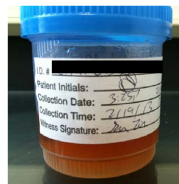
Figure 2: Adequate urine volume and legible label information.