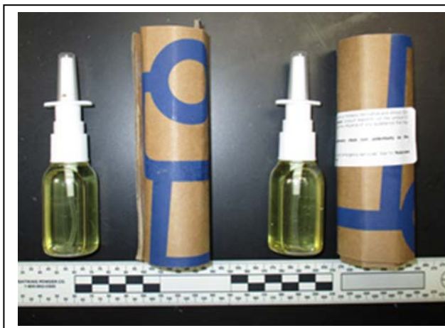
A package mailed from Sweden contained two nasal-spray bottles of para -fluorobutyrylfentanyl, a Schedule I controlled substance in Oregon, and included safety warnings.

The Postmortem Toxicology section in the Portland Laboratory works with the Medical Examiner's Office on investigations homicides, officer-involved deaths, traffic fatalities and many other suspicious or unattended deaths. Postmortem Toxicology examines blood, urine and tissue specimens for the presence of alcohol, controlled substances and pharmaceuticals. In August 2015, two cases proved to be of particular interest to law enforcement; both involved deaths caused by ingestion of new designer opioids. The Toxicology section developed a new method for determining the amount of these drugs in the blood of decedents. We also demonstrated that a new instrument currently being validated will be very helpful in identifying new designer drugs as they appear in casework. Submission of the actual drugs found at the scene of these two deaths was also extremely helpful in determining the cause of death.